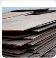
Secondary M S plates