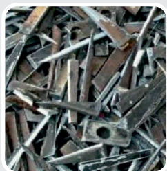
M S plate cutting scrap