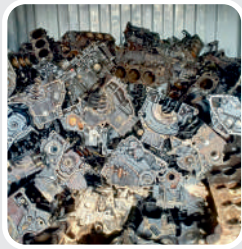
Cast iron engine