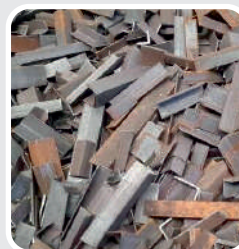
M S angle cutting scrap