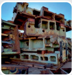
Cast iron tool cast