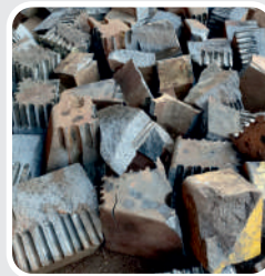
Cast iron 25-70 kgs