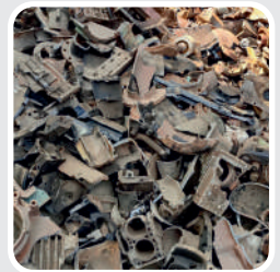
Cast iron broken Machinery