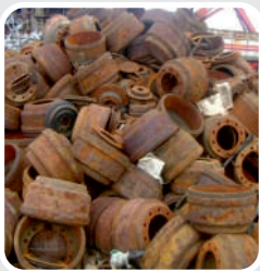
Cast iron drums