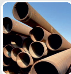
Seamless & welded pipes