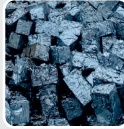
CRC busheling bales