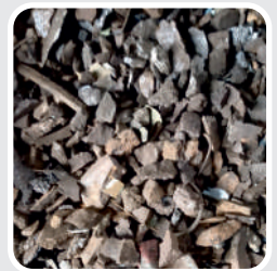
Cast iron chips