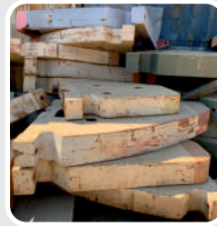
Cast Iron Counter Weights