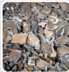
Cast iron 5-25 kgs