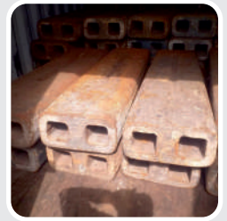
Cast iron moulds