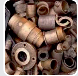
Gun Metal Scrap