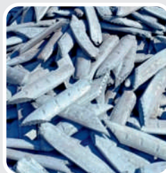
M S fish cutting scrap