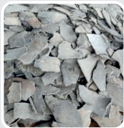
Ductile iron pipes