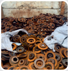
Cast iron rotors