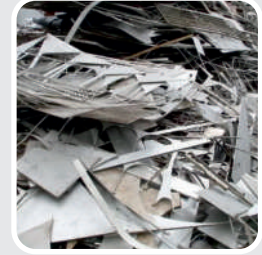
SS Scrap all grades