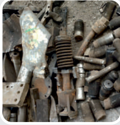
ALLOY STEEL SCRAP